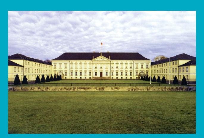
Subsurface construction of a basement by jet grouting at Bellevue Castle, Berlin