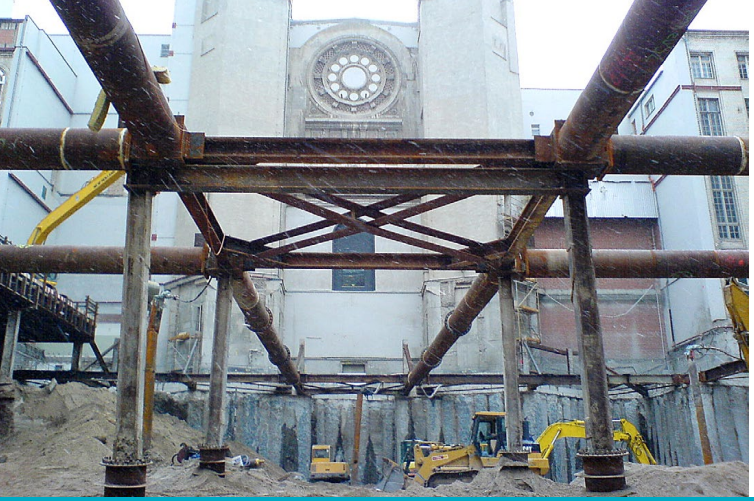
Rescue pit for historical documents in Cologne